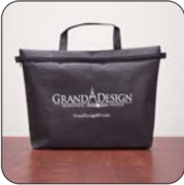
Owner Information Package